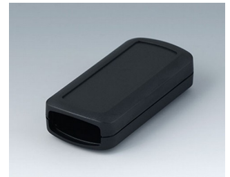
B2823109 CONNECT S ASA+PC (UL 94 V-0) black RAL 9005 3.54"x1.65"x0.87"