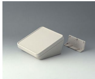
B4414207 PROTEC 140, Vers. II ASA+PC (UL 94 V-0) off-white RAL 9002 5.51"x5.51"x2.99" IP 65 opt.