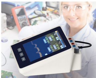
Multimeter measuring device