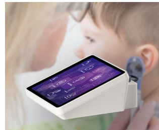
Hearing test device