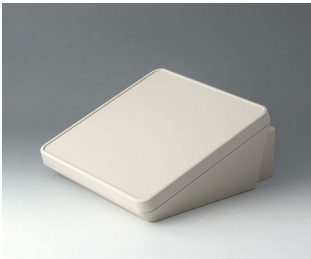
B4422307 PROTEC 220, Vers. III ASA+PC (UL 94 V-0) off-white RAL 9002 8.66"x9.57"x4.25" IP 65 opt.