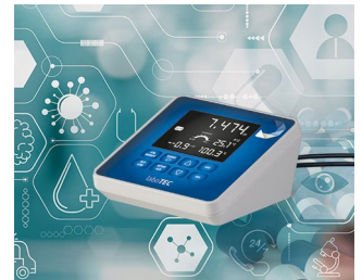
Laboratory measuring device