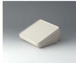
B4414307 PROTEC 140, Vers. III ASA+PC (UL 94 V-0) off-white RAL 9002 5.51"x6.30"x2.99" IP 65 opt.