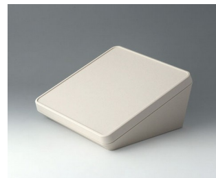
B4422107 PROTEC 220, Vers. I ASA+PC (UL 94 V-0) off-white RAL 9002 8.66"x8.66"x4.25" IP 65 opt.