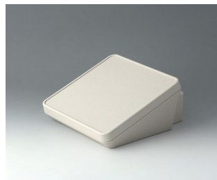
B4418307 PROTEC 180, Vers. III ASA+PC (UL 94 V-0) off-white RAL 9002 7.09"x7.91"x3.62" IP 65 opt.