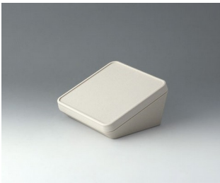
B4414107 PROTEC 140, Vers. I ASA+PC (UL 94 V-0) off-white RAL 9002 5.51"x5.51"x2.99" IP 65 opt.