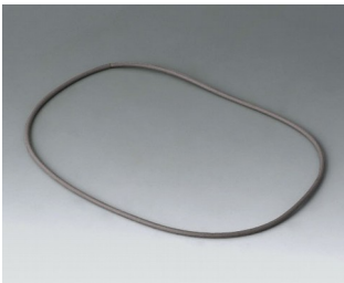
B4514030 Sealing 140