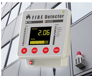
Terminal for fire alarm systems