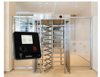
Terminal for access control