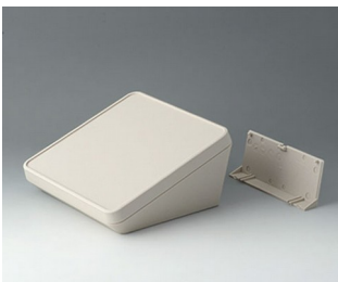
B4418207 PROTEC 180, Vers. II ASA+PC (UL 94 V-0) off-white RAL 9002 7.09"x7.09"x3.62" IP 65 opt.