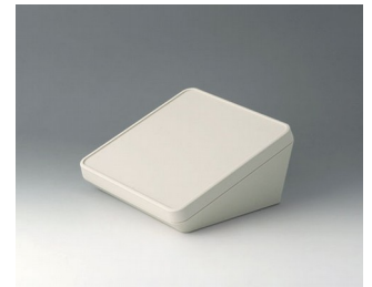
B4418107 PROTEC 180, Vers. I ASA+PC (UL 94 V-0) off-white RAL 9002 7.09"x7.09"x3.62" IP 65 opt.