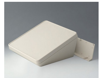
B4422207 PROTEC 220, Vers. II ASA+PC (UL 94 V-0) off-white RAL 9002 8.66"x8.66"x4.25" IP 65 opt.