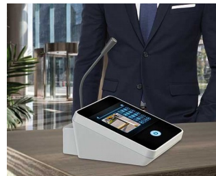
Table microphone / inter phone