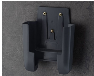
A9107628 Holder L ASA+PC (UL 94 V-0) lava