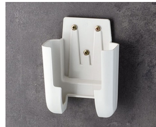
A9106627 Holder M ASA+PC (UL 94 V-0) off-white RAL 9002