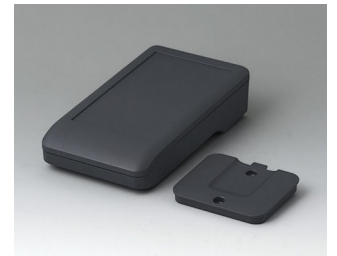
A9005218 DATEC-COMPACT S ASA+PC (UL 94 V-0) lava 5.35"x2.91"x1.26" IP 41