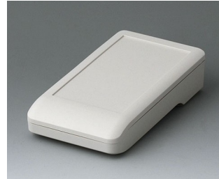
A9005117 DATEC-COMPACT S ASA+PC (UL 94 V-0) off-white RAL 9002 5.35"x2.91"x1.26" IP 41