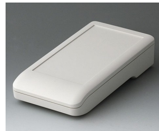
A9006117 DATEC-COMPACT M ASA+PC (UL 94 V-0) off-white RAL 9002 6.77"x3.62"x1.54" IP 41