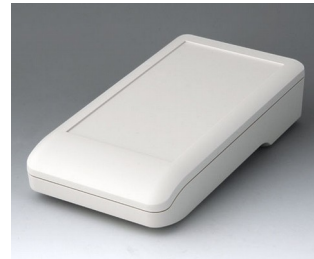
A9007117 DATEC-COMPACT L ASA+PC (UL 94 V-0) off-white RAL 9002 8.11"x4.33"x1.85" IP 41