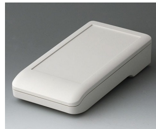
A9006117 DATEC-COMPACT M ASA+PC (UL 94 V-0) off-white RAL 9002 6.77"x3.62"x1.54" IP 41