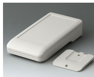
A9006217 DATEC-COMPACT M ASA+PC (UL 94 V-0) off-white RAL 9002 6.77"x3.62"x1.54" IP 41