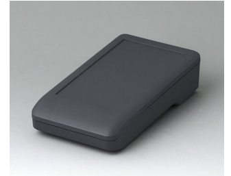
A9005118 DATEC-COMPACT S ASA+PC (UL 94 V-0) lava 5.35"x2.91"x1.26" IP 41