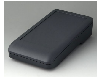
A9007118 DATEC-COMPACT L ASA+PC (UL 94 V-0) lava 8.11"x4.33"x1.85" IP 41