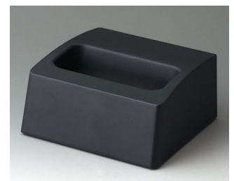
A9106508 Station M ASA+PC (UL 94 V-0) lava