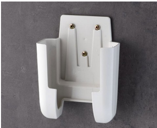
A9107627 Holder L ASA+PC (UL 94 V-0) off-white RAL 9002