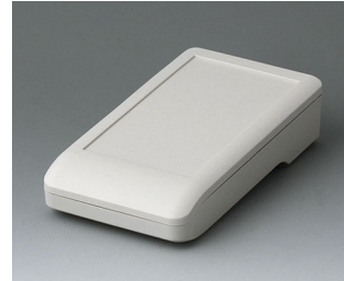
A9005117 DATEC-COMPACT S ASA+PC (UL 94 V-0) off-white RAL 9002 5.35"x2.91"x1.26" IP 41