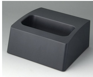
A9107508 Station L ASA+PC (UL 94 V-0) lava