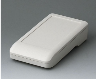
A9005107 DATEC-COMPACT S ASA+PC (UL 94 V-0) off-white RAL 9002 5.35"x2.91"x1.26" IP 65