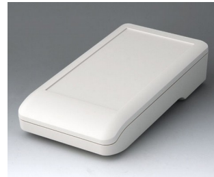
A9007117 DATEC-COMPACT L ASA+PC (UL 94 V-0) off-white RAL 9002 8.11"x4.33"x1.85" IP 41