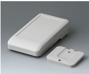
A9005207 DATEC-COMPACT S ASA+PC (UL 94 V-0) off-white RAL 9002 5.35"x2.91"x1.26" IP 65