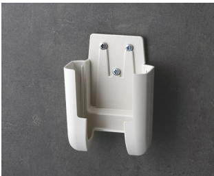
A9105627 Holder S ASA+PC (UL 94 V-0) off-white RAL 9002