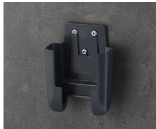
A9105628 Holder S ASA+PC (UL 94 V-0) lava