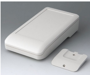
A9007207 DATEC-COMPACT L ASA+PC (UL 94 V-0) off-white RAL 9002 8.11"x4.33"x1.85" IP 65