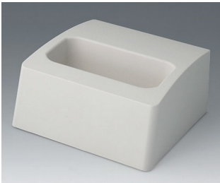
A9107507 Station L ASA+PC (UL 94 V-0) off-white RAL 9002