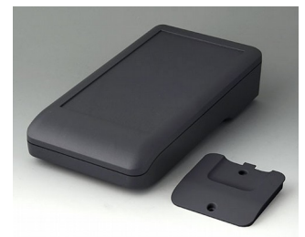
A9007218 DATEC-COMPACT L ASA+PC (UL 94 V-0) lava 8.11"x4.33"x1.85" IP 41