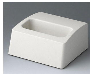
A9106507 Station M ASA+PC (UL 94 V-0) off-white RAL 9002