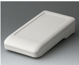
A9006107 DATEC-COMPACT M ASA+PC (UL 94 V-0) off-white RAL 9002 6.77"x3.62"x1.54" IP 65