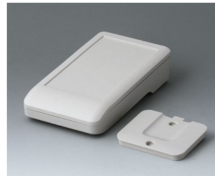
A9005217 DATEC-COMPACT S ASA+PC (UL 94 V-0) off-white RAL 9002 5.35"x2.91"x1.26" IP 41