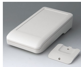
A9007217 DATEC-COMPACT L ASA+PC (UL 94 V-0) off-white RAL 9002 8.11"x4.33"x1.85" IP 41