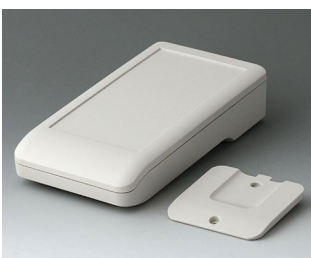
A9006207 DATEC-COMPACT M ASA+PC (UL 94 V-0) off-white RAL 9002 6.77"x3.62"x1.54" IP 65