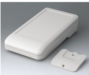
A9007207 DATEC-COMPACT L ASA+PC (UL 94 V-0) off-white RAL 9002 8.11"x4.33"x1.85" IP 65