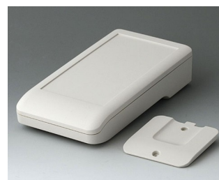
A9006217 DATEC-COMPACT M ASA+PC (UL 94 V-0) off-white RAL 9002 6.77"x3.62"x1.54" IP 41