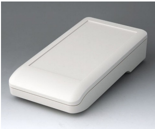
A9007107 DATEC-COMPACT L ASA+PC (UL 94 V-0) off-white RAL 9002 8.11"x4.33"x1.85" IP 65