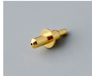
A9193031 Spring contact gold-plated