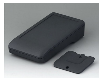
A9006218 DATEC-COMPACT M ASA+PC (UL 94 V-0) lava 6.77"x3.62"x1.54" IP 41