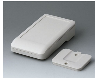
A9005217 DATEC-COMPACT S ASA+PC (UL 94 V-0) off-white RAL 9002 5.35"x2.91"x1.26" IP 41