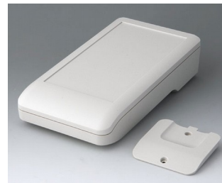
A9007217 DATEC-COMPACT L ASA+PC (UL 94 V-0) off-white RAL 9002 8.11"x4.33"x1.85" IP 41