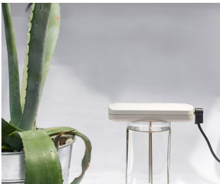
Tool for making colloidal silver solutions