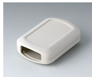
B2832107 CONNECT M ASA+PC (UL 94 V-0) off-white RAL 9002 2.99"x2.13"x0.87"