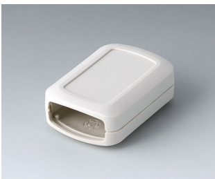
B2822107 CONNECT S ASA+PC (UL 94 V-0) off-white RAL 9002 2.36"x1.65"x0.87"