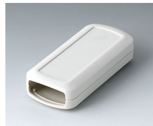
B2823107 CONNECT S ASA+PC (UL 94 V-0) off-white RAL 9002 3.54"x1.65"x0.87"