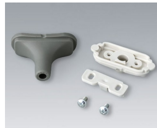
B2911328 Cable gland kit, 0.197" - 0.232" TPE volcano