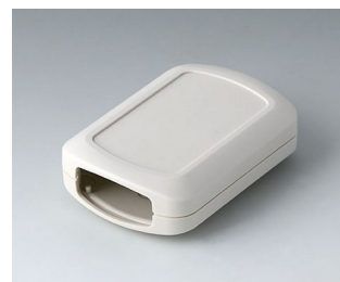
B2832107 CONNECT M ASA+PC (UL 94 V-0) off-white RAL 9002 2.99"x2.13"x0.87"