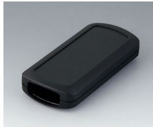
B2833109 CONNECT M ASA+PC (UL 94 V-0) black RAL 9005 4.57"x2.13"x0.87"