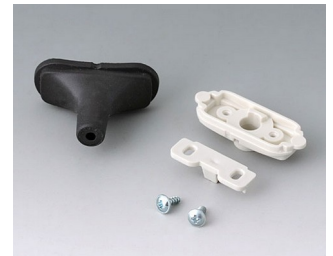
B2911309 Cable gland kit, 0.134" - 0.165" TPE black RAL 9005