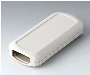
B2833107 CONNECT M ASA+PC (UL 94 V-0) off-white RAL 9002 4.57"x2.13"x0.87"