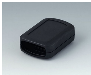
B2822109 CONNECT S ASA+PC (UL 94 V-0) black RAL 9005 2.36"x1.65"x0.87"