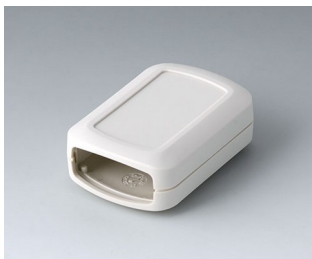
B2822107 CONNECT S ASA+PC (UL 94 V-0) off-white RAL 9002 2.36"x1.65"x0.87"