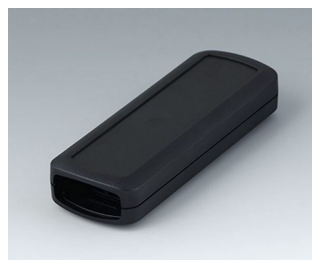
B2824109 CONNECT S ASA+PC (UL 94 V-0) black RAL 9005 4.72"x1.65"x0.87"