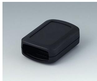
B2822109 CONNECT S ASA+PC (UL 94 V-0) black RAL 9005 2.36"x1.65"x0.87"