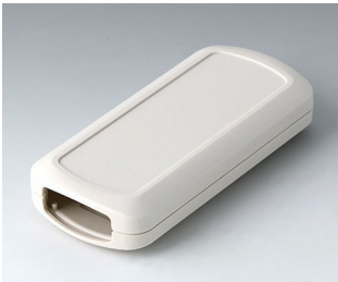
B2833107 CONNECT M ASA+PC (UL 94 V-0) off-white RAL 9002 4.57"x2.13"x0.87"