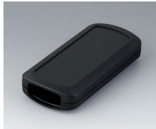
B2833109 CONNECT M ASA+PC (UL 94 V-0) black RAL 9005 4.57"x2.13"x0.87"