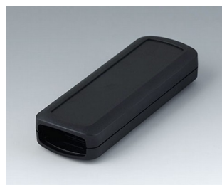
B2824109 CONNECT S ASA+PC (UL 94 V-0) black RAL 9005 4.72"x1.65"x0.87"