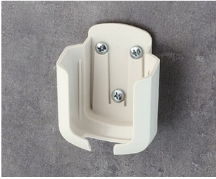
B2931507 Holder M ASA+PC (UL 94 V-0) off-white RAL 9002