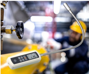
Gas leak detector