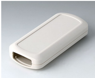
B2833107 CONNECT M ASA+PC (UL 94 V-0) off-white RAL 9002 4.57"x2.13"x0.87"