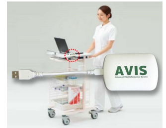
Receiver and data transfer for EMR