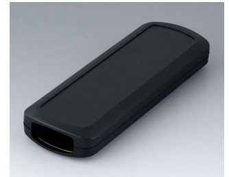
B2834109 CONNECT M ASA+PC (UL 94 V-0) black RAL 9005 6.14"x2.13"x0.87"