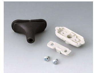
B2911329 Cable gland kit, 0.197" - 0.232" TPE black RAL 9005