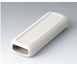
B2824107 CONNECT S ASA+PC (UL 94 V-0) off-white RAL 9002 4.72"x1.65"x0.87"