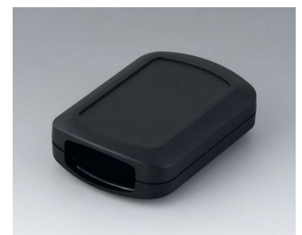
B2832109 CONNECT M ASA+PC (UL 94 V-0) black RAL 9005 2.99"x2.13"x0.87"