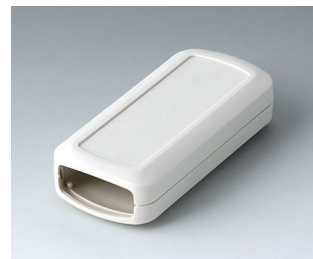
B2823107 CONNECT S ASA+PC (UL 94 V-0) off-white RAL 9002 3.54"x1.65"x0.87"