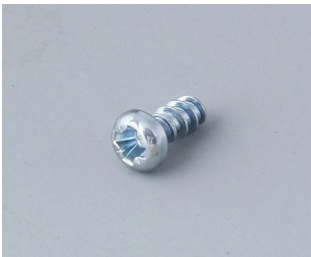
A0304031 Self-tapping screws 0.087" x 0.197" (PZ1)

Subject to technical modification without notice. © by OKW Gehäusesysteme, Buchen/Germany.