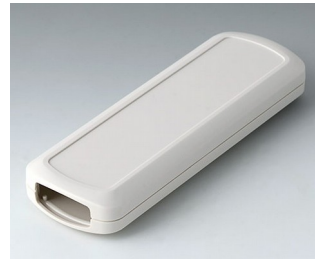
B2834107 CONNECT M ASA+PC (UL 94 V-0) off-white RAL 9002 6.14"x2.13"x0.87"