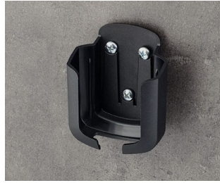
B2931509 Holder M ASA+PC (UL 94 V-0) black RAL 9005