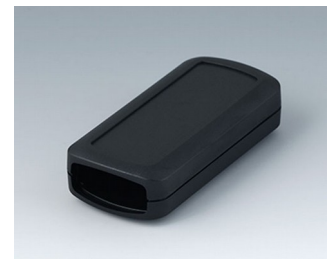
B2823109 CONNECT S ASA+PC (UL 94 V-0) black RAL 9005 3.54"x1.65"x0.87"