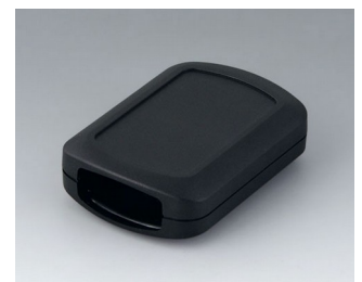
B2832109 CONNECT M ASA+PC (UL 94 V-0) black RAL 9005 2.99"x2.13"x0.87"