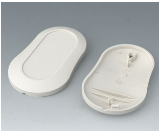
B9004907 Bottom and top part DM ABS (UL 94 HB) off-white RAL 9002 2.76"x1.73"x0.63"