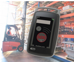
Mobile Security Solutions for workers