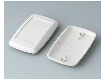
B9006807 Bottom and top part EL ABS (UL 94 HB) off-white RAL 9002 3.07"x1.89"x0.79"