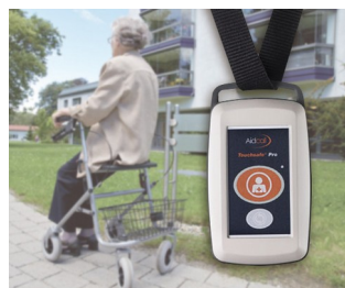
Radio transmitter for emergency call system for patients