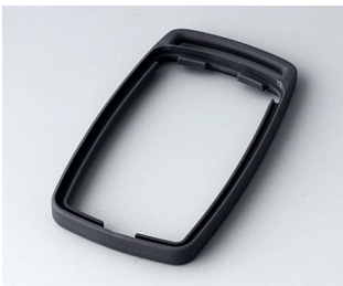
B9002702 Intermediate ring ES TPE lava