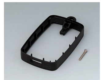
B9004796 Intermediate ring EM, USB type A PMMA (IR) (UL 94 HB) black RAL 9005