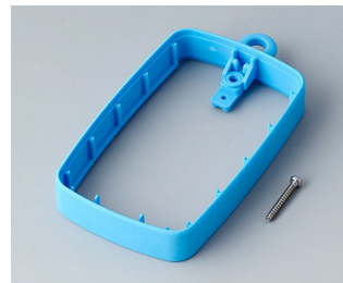
B9004785 Intermediate ring EM, high TPE blue