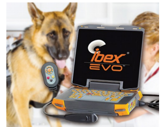
Portable ultrasonic device for veterinary medicine