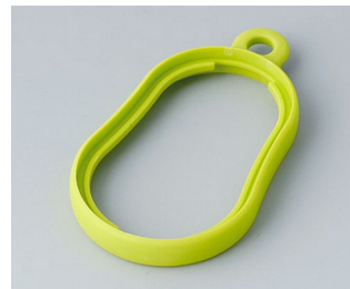
B9002354 Intermediate ring DS TPE green