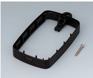
B9004776 Intermediate ring EM, Micro USB 5 P, B Type SMT PMMA (IR) (UL 94 HB) black RAL 9005