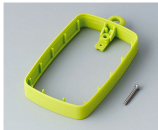
B9004784 Intermediate ring EM, high SEBS (TPE) green