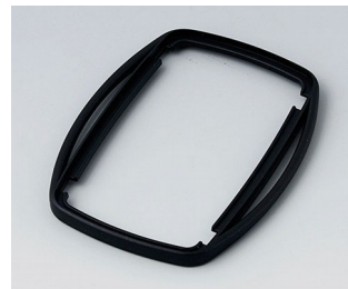
B9006756 Intermediate ring EL PMMA (IR) (UL 94 HB) black RAL 9005