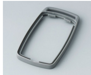
B9002708 Intermediate ring ES TPE volcano