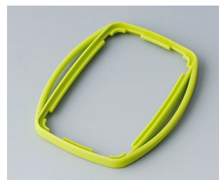
B9004754 Intermediate ring EM TPE green