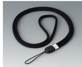
B9100063 Carrying strap, textile lanyard black 33.86"