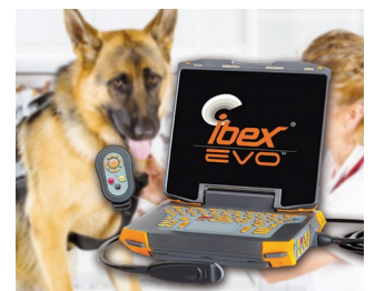
Portable ultrasonic device for veterinary medicine