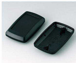
B9006816 Bottom and top part EL PMMA (IR) (UL 94 HB) black RAL 9005 3.07"x1.89"x0.94"