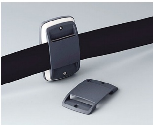
B9106108 Strap eyelet EL ABS (UL 94 HB) lava