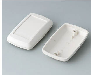
B9006827 Bottom and top part EL ABS (UL 94 HB) off-white RAL 9002 3.07"x1.89"x1.02"