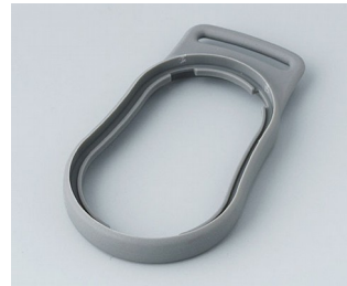
B9002308 Intermediate ring DS TPE volcano