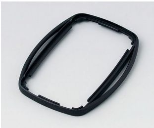
B9004756 Intermediate ring EM PMMA (IR) (UL 94 HB) black RAL 9005