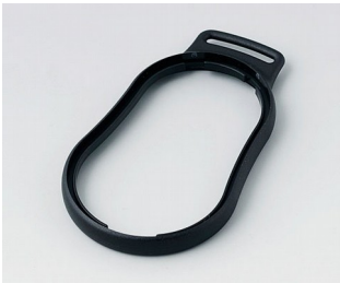
B9004306 Intermediate ring DM PMMA (IR) (UL 94 HB) black RAL 9005