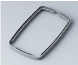
B9006788 Intermediate ring EL TPE volcano