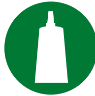
Installation / Assembly of accessories