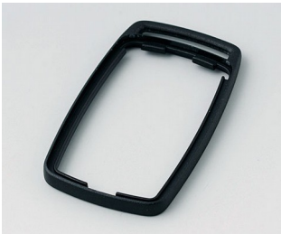
B9002706 Intermediate ring ES PMMA (IR) (UL 94 HB) black RAL 9005