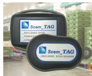
RFID sensor transponder and data logger