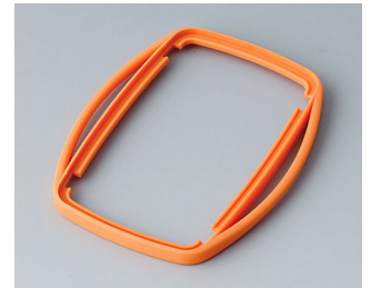
B9006753 Intermediate ring EL TPE orange