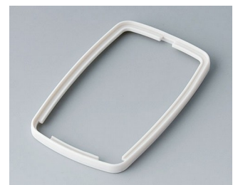
B9006787 Intermediate ring EL SEBS (TPE) off-white RAL 9002