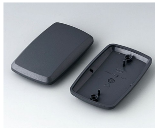
B9006858 Bottom and top part EL ABS (UL 94 HB) lava 3.07"x1.89"x0.79"