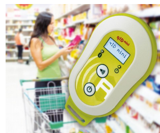
Mobile UHF RFID scanner