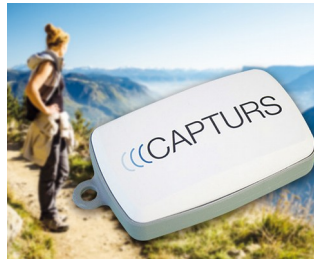
GPS tracking in real time