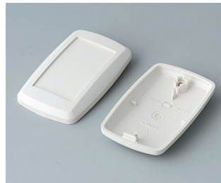
B9002807 Bottom and top part ES ABS (UL 94 HB) off-white RAL 9002 2.05"x1.26"x0.59"