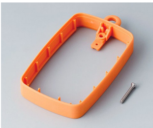
B9004783 Intermediate ring EM, high TPE orange