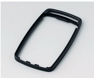
B9004706 Intermediate ring EM PMMA (IR) (UL 94 HB) black RAL 9005