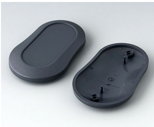
B9006908 Bottom and top part DL ABS (UL 94 HB) lava 3.31"x2.09"x0.75"