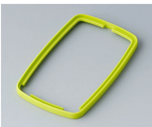
B9006784 Intermediate ring EL SEBS (TPE) green