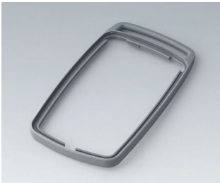
B9006708 Intermediate ring EL TPE volcano