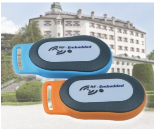
Mobile RFID information system