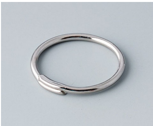
A9164001 Key ring Steel nickel-plated 0.81"