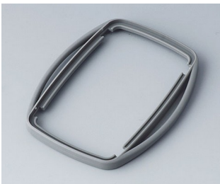
B9006758 Intermediate ring EL TPE volcano