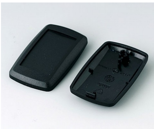
B9002806 Bottom and top part ES PMMA (IR) (UL 94 HB) black RAL 9005 2.05"x1.26"x0.59"