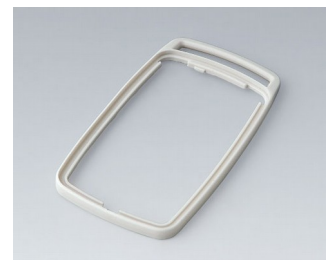
B9006707 Intermediate ring EL SEBS (TPE) off-white RAL 9002