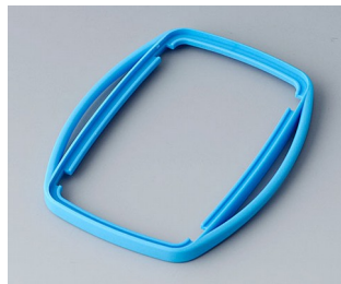
B9006755 Intermediate ring EL TPE blue