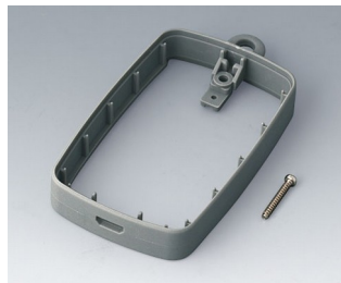
B9004778 Intermediate ring EM, Micro USB 5 P, B Type SMT SEBS (TPE) volcano