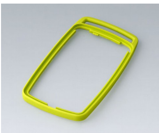
B9006704 Intermediate ring EL SEBS (TPE) green