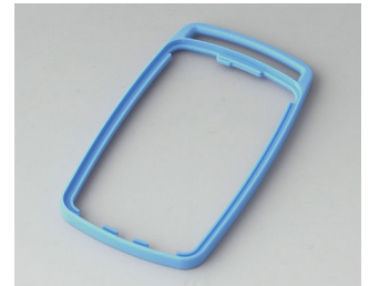
B9004705 Intermediate ring EM TPE blue