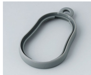
B9002358 Intermediate ring DS TPE volcano