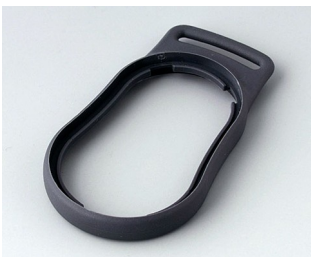
B9002302 Intermediate ring DS TPE lava