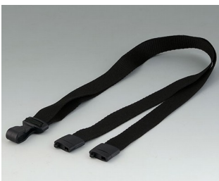
B9100073 Carrying strap, textile lanyard black 35.98"x0.63"