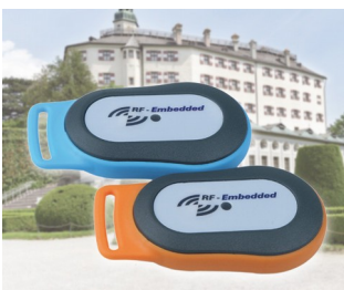
Mobile RFID information system