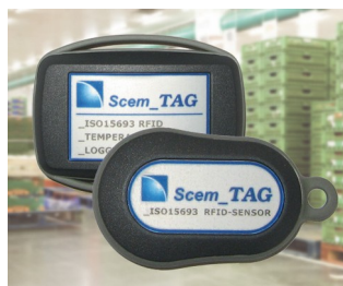
RFID sensor transponder and data logger