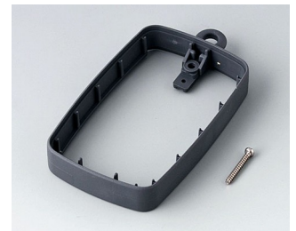
B9004782 Intermediate ring EM, high SEBS (TPE) lava