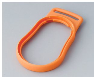
B9002303 Intermediate ring DS SEBS (TPE) orange