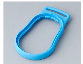
B9002305 Intermediate ring DS TPE blue