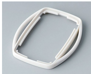
B9002757 Intermediate ring ES TPE off-white RAL 9002