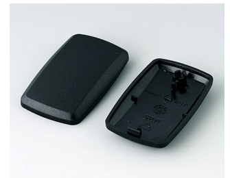
B9002856 Bottom and top part ES PMMA (IR) (UL 94 HB) black RAL 9005 2.05"x1.26"x0.59"