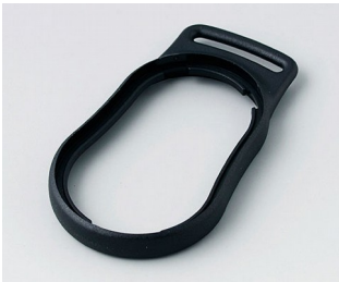
B9002306 Intermediate ring DS PMMA (IR) (UL 94 HB) black RAL 9005