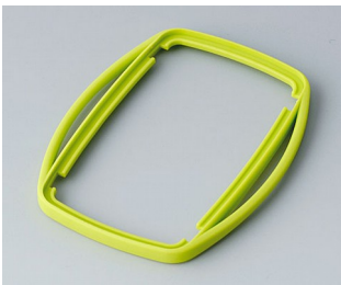
B9006754 Intermediate ring EL SEBS (TPE) green