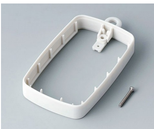
B9004787 Intermediate ring EM, high SEBS (TPE) off-white RAL 9002