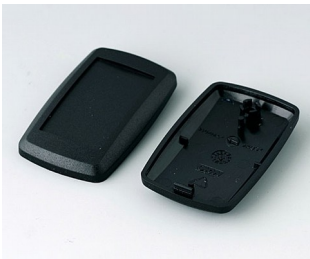
B9002806 Bottom and top part ES PMMA (IR) (UL 94 HB) black RAL 9005 2.05"x1.26"x0.59"