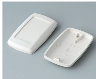
B9002807 Bottom and top part ES ABS (UL 94 HB) off-white RAL 9002 2.05"x1.26"x0.59"