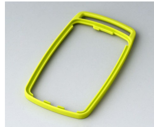
B9004704 Intermediate ring EM TPE green