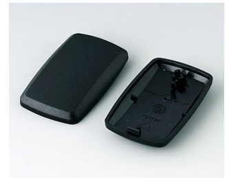
B9002856 Bottom and top part ES PMMA (IR) (UL 94 HB) black RAL 9005 2.05"x1.26"x0.59"