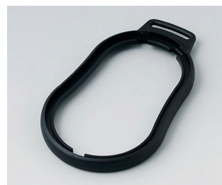
B9006306 Intermediate ring DL PMMA (IR) (UL 94 HB) black RAL 9005