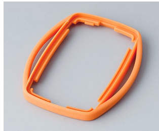
B9002753 Intermediate ring ES TPE orange