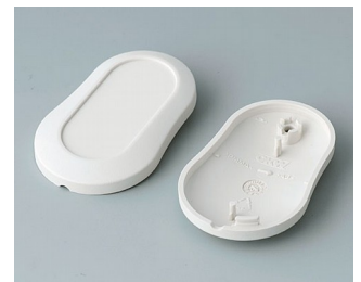
B9002907 Bottom and top part DS ABS (UL 94 HB) off-white RAL 9002 2.01"x1.26"x0.51"