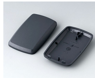
B9004858 Bottom and top part EM ABS (UL 94 HB) lava 2.68"x1.65"x0.71"