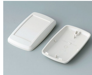
B9004807 Bottom and top part EM ABS (UL 94 HB) off-white RAL 9002 2.68"x1.65"x0.71"