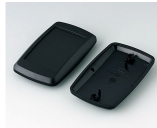
B9006806 Bottom and top part EL PMMA (IR) (UL 94 HB) black RAL 9005 3.07"x1.89"x0.79"