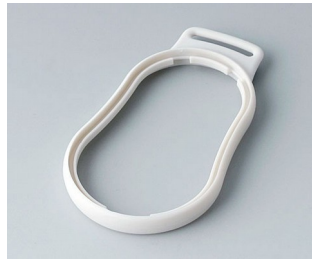
B9004307 Intermediate ring DM SEBS (TPE) off-white RAL 9002