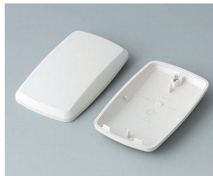
B9004857 Bottom and top part EM ABS (UL 94 HB) off-white RAL 9002 2.68"x1.65"x0.71"