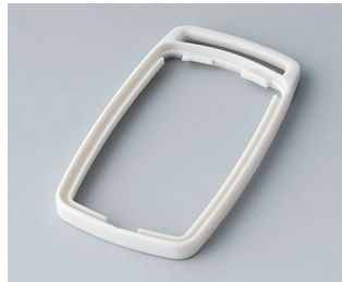
B9002707 Intermediate ring ES TPE off-white RAL 9002