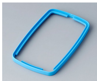
B9006785 Intermediate ring EL TPE blue