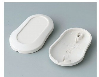
B9002907 Bottom and top part DS ABS (UL 94 HB) off-white RAL 9002 2.01"x1.26"x0.51"