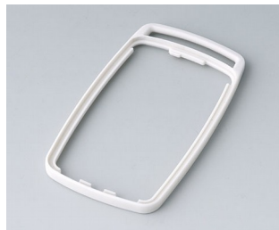
B9004707 Intermediate ring EM TPE off-white RAL 9002