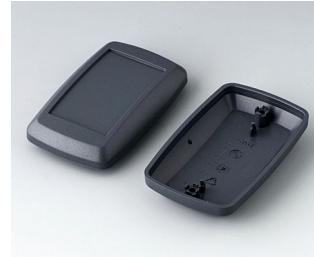
B9006828 Bottom and top part EL ABS (UL 94 HB) lava 3.07"x1.89"x1.02"