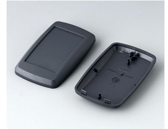
B9004808 Bottom and top part EM ABS (UL 94 HB) lava 2.68"x1.65"x0.71"