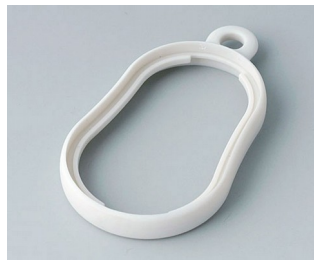
B9002357 Intermediate ring DS SEBS (TPE) off-white RAL 9002