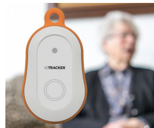
LoRa GPS tracker with alarm button