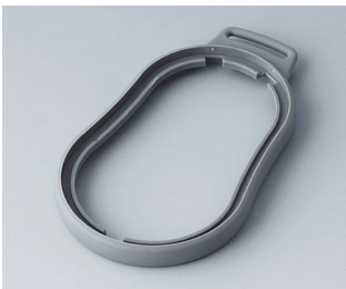
B9006308 Intermediate ring DL TPE volcano