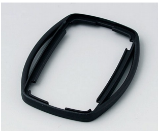
B9002756 Intermediate ring ES PMMA (IR) (UL 94 HB) black RAL 9005