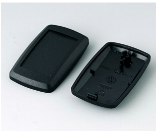
B9002806 Bottom and top part ES PMMA (IR) (UL 94 HB) black RAL 9005 2.05"x1.26"x0.59"