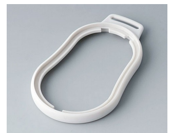
B9006307 Intermediate ring DL SEBS (TPE) off-white RAL 9002