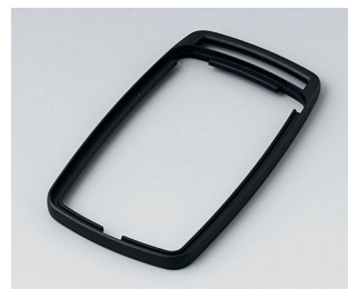
B9006706 Intermediate ring EL PMMA (IR) (UL 94 HB) black RAL 9005