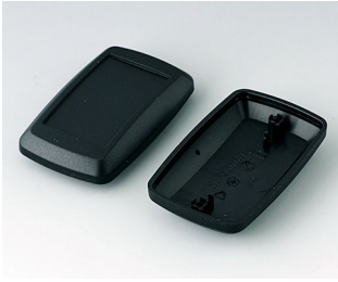
B9006826 Bottom and top part EL PMMA (IR) (UL 94 HB) black RAL 9005 3.07"x1.89"x1.02"