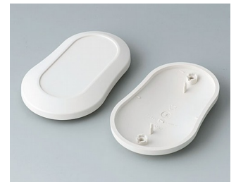
B9006907 Bottom and top part DL ABS (UL 94 HB) off-white RAL 9002 3.31"x2.09"x0.75"