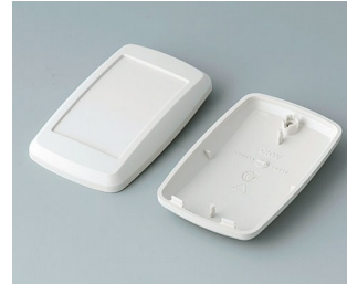
B9004807 Bottom and top part EM ABS (UL 94 HB) off-white RAL 9002 2.68"x1.65"x0.71"