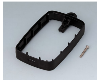
B9004779 Intermediate ring EM, Micro USB 5 P, B Type SMT ABS (UL 94 HB) black RAL 9005