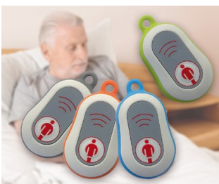
Radio paging systems