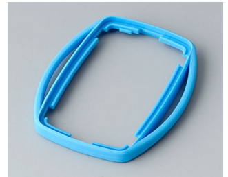
B9002755 Intermediate ring ES TPE blue