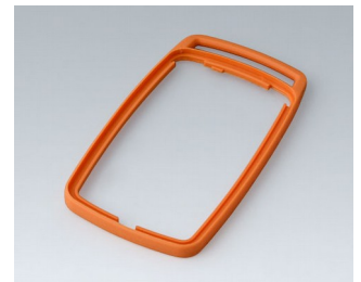
B9006703 Intermediate ring EL TPE orange