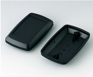
B9006826 Bottom and top part EL PMMA (IR) (UL 94 HB) black RAL 9005 3.07"x1.89"x1.02"