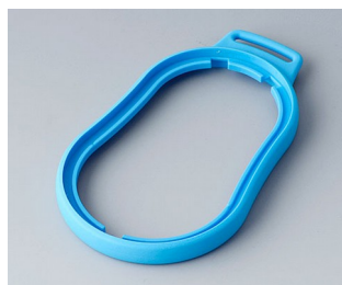
B9006305 Intermediate ring DL TPE blue