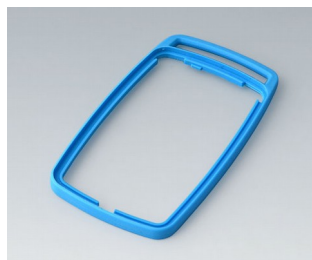
B9006705 Intermediate ring EL TPE blue