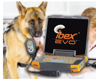
Portable ultrasonic device for veterinary medicine