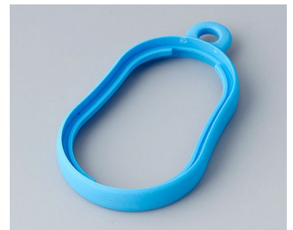
B9002355 Intermediate ring DS TPE blue