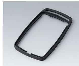
B9006702 Intermediate ring EL TPE lava