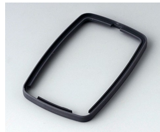
B9006782 Intermediate ring EL SEBS (TPE) lava