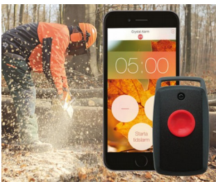
A personal alarm on your mobile phone