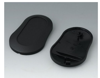
B9004906 Bottom and top part DM PMMA (IR) (UL 94 HB) black RAL 9005 2.76"x1.73"x0.63"