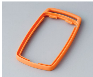
B9002703 Intermediate ring ES TPE orange