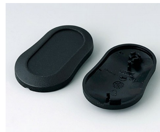
B9002906 Bottom and top part DS PMMA (IR) (UL 94 HB) black RAL 9005 2.01"x1.26"x0.51"