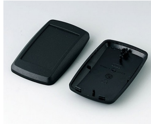
B9004806 Bottom and top part EM PMMA (IR) (UL 94 HB) black RAL 9005 2.68"x1.65"x0.71"