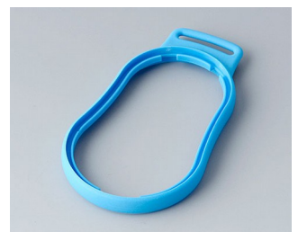
B9004305 Intermediate ring DM TPE blue