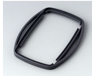
B9006752 Intermediate ring EL TPE lava