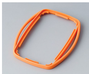
B9004753 Intermediate ring EM SEBS (TPE) orange