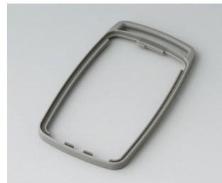
B9004708 Intermediate ring EM TPE volcano