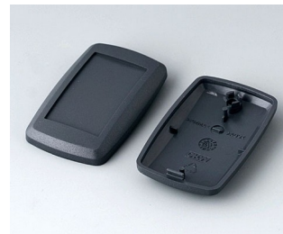
B9002808 Bottom and top part ES ABS (UL 94 HB) lava 2.05"x1.26"x0.59"