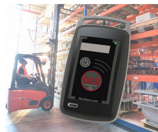
Mobile Security Solutions for workers