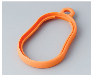
B9002353 Intermediate ring DS TPE orange