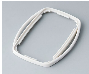
B9004757 Intermediate ring EM SEBS (TPE) off-white RAL 9002