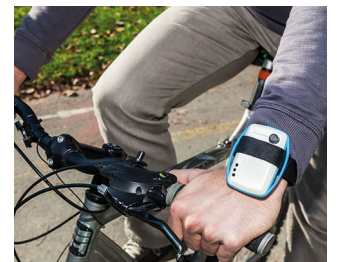
Mobile air quality monitoring