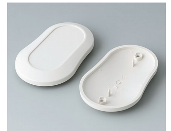
B9006907 Bottom and top part DL ABS (UL 94 HB) off-white RAL 9002 3.31"x2.09"x0.75"