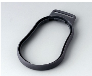
B9004302 Intermediate ring DM TPE lava