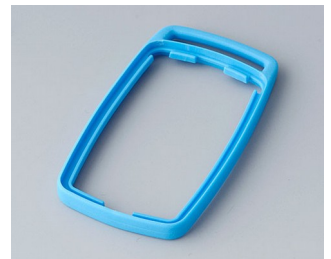
B9002705 Intermediate ring ES TPE blue