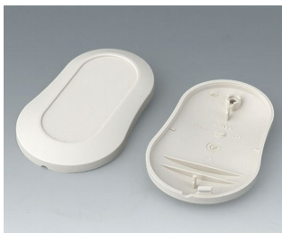
B9004907 Bottom and top part DM ABS (UL 94 HB) off-white RAL 9002 2.76"x1.73"x0.63"