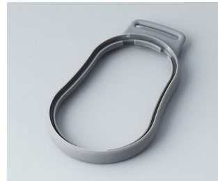
B9004308 Intermediate ring DM TPE volcano