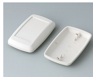
B9006817 Bottom and top part EL ABS (UL 94 HB) off-white RAL 9002 3.07"x1.89"x0.94"