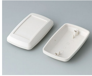
B9006827 Bottom and top part EL ABS (UL 94 HB) off-white RAL 9002 3.07"x1.89"x1.02"