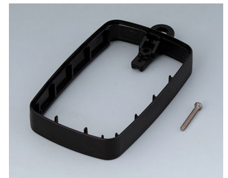
B9004786 Intermediate ring EM, high PMMA (IR) (UL 94 HB) black RAL 9005