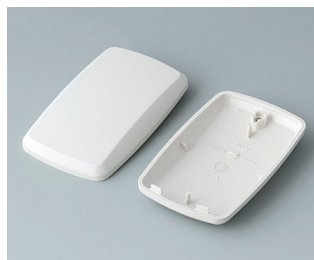
B9004857 Bottom and top part EM ABS (UL 94 HB) off-white RAL 9002 2.68"x1.65"x0.71"