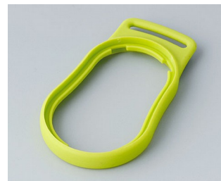
B9002304 Intermediate ring DS SEBS (TPE) green