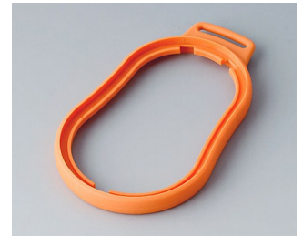
B9006303 Intermediate ring DL TPE orange