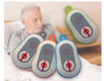
Radio paging systems