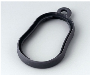
B9002352 Intermediate ring DS TPE lava