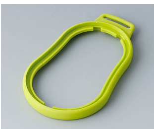
B9006304 Intermediate ring DL TPE green