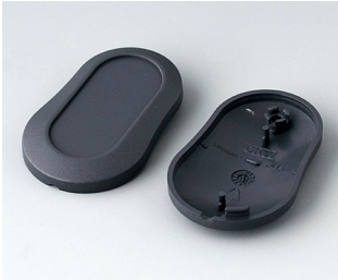
B9002908 Bottom and top part DS ABS (UL 94 HB) lava 2.01"x1.26"x0.51"