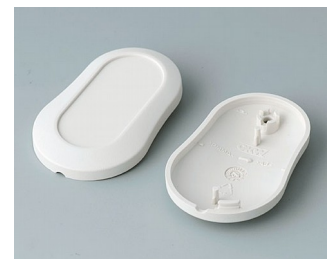
B9002907 Bottom and top part DS ABS (UL 94 HB) off-white RAL 9002 2.01"x1.26"x0.51"