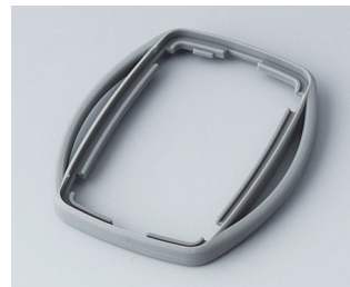
B9002758 Intermediate ring ES TPE volcano