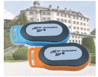
Mobile RFID information system