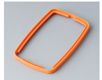
B9006783 Intermediate ring EL TPE orange