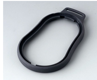
B9006302 Intermediate ring DL TPE lava