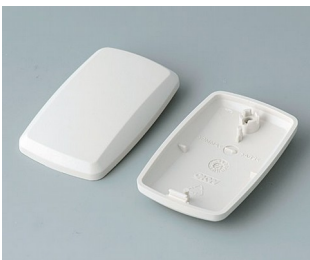
B9002857 Bottom and top part ES ABS (UL 94 HB) off-white RAL 9002 2.05"x1.26"x0.59"