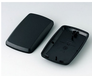
B9004856 Bottom and top part EM PMMA (IR) (UL 94 HB) black RAL 9005 2.68"x1.65"x0.71"