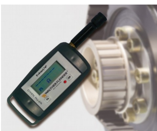
Tension meter for measuring belt pretension