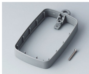
B9004788 Intermediate ring EM, high TPE volcano