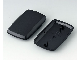
B9006856 Bottom and top part EL PMMA (IR) (UL 94 HB) black RAL 9005 3.07"x1.89"x0.79"