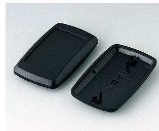
B9006806 Bottom and top part EL PMMA (IR) (UL 94 HB) black RAL 9005 3.07"x1.89"x0.79"