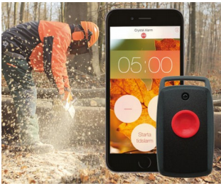
A personal alarm on your mobile phone