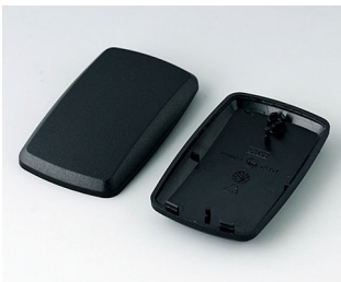
B9004856 Bottom and top part EM PMMA (IR) (UL 94 HB) black RAL 9005 2.68"x1.65"x0.71"