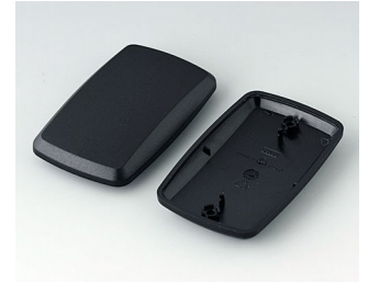
B9006856 Bottom and top part EL PMMA (IR) (UL 94 HB) black RAL 9005 3.07"x1.89"x0.79"