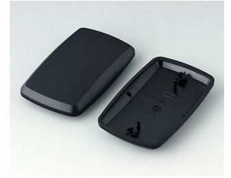
B9006856 Bottom and top part EL PMMA (IR) (UL 94 HB) black RAL 9005 3.07"x1.89"x0.79"