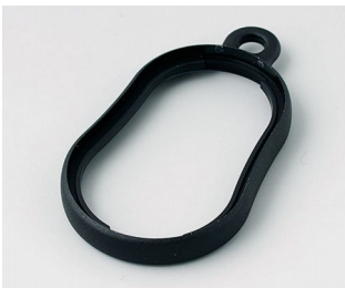
B9002356 Intermediate ring DS PMMA (IR) (UL 94 HB) black RAL 9005