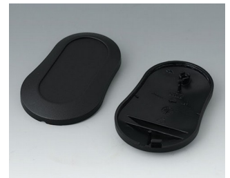
B9004906 Bottom and top part DM PMMA (IR) (UL 94 HB) black RAL 9005 2.76"x1.73"x0.63"