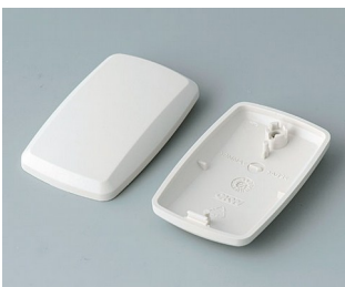
B9002857 Bottom and top part ES ABS (UL 94 HB) off-white RAL 9002 2.05"x1.26"x0.59"