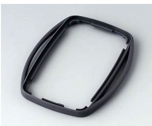
B9004752 Intermediate ring EM TPE lava