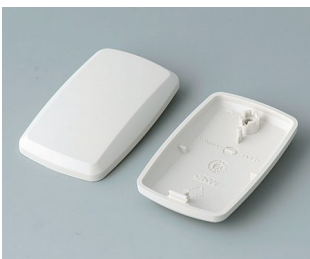
B9002857 Bottom and top part ES ABS (UL 94 HB) off-white RAL 9002 2.05"x1.26"x0.59"