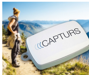
GPS tracking in real time