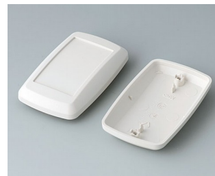
B9006817 Bottom and top part EL ABS (UL 94 HB) off-white RAL 9002 3.07"x1.89"x0.94"