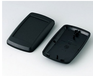
B9004806 Bottom and top part EM PMMA (IR) (UL 94 HB) black RAL 9005 2.68"x1.65"x0.71"