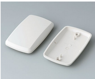
B9006857 Bottom and top part EL ABS (UL 94 HB) off-white RAL 9002 3.07"x1.89"x0.79"