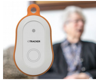
LoRa GPS tracker with alarm button