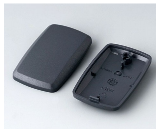
B9002858 Bottom and top part ES ABS (UL 94 HB) lava 2.05"x1.26"x0.59"