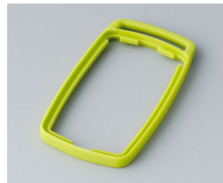
B9002704 Intermediate ring ES TPE green