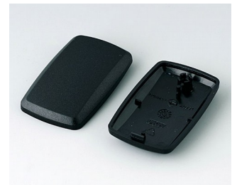
B9002856 Bottom and top part ES PMMA (IR) (UL 94 HB) black RAL 9005 2.05"x1.26"x0.59"