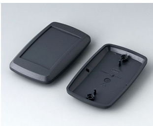
B9006808 Bottom and top part EL ABS (UL 94 HB) lava 3.07"x1.89"x0.79"