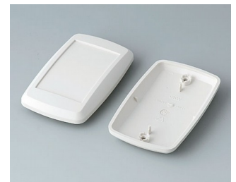
B9006807 Bottom and top part EL ABS (UL 94 HB) off-white RAL 9002 3.07"x1.89"x0.79"