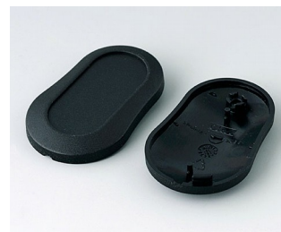
B9002906 Bottom and top part DS PMMA (IR) (UL 94 HB) black RAL 9005 2.01"x1.26"x0.51"