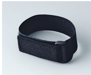
B9100033 Wrist strap black 11.02"