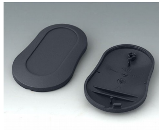
B9004908 Bottom and top part DM ABS (UL 94 HB) lava 2.76"x1.73"x0.63"