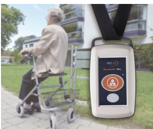
Radio transmitter for emergency call system for patients