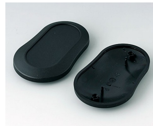
B9006906 Bottom and top part DL PMMA (IR) (UL 94 HB) black RAL 9005 3.31"x2.09"x0.75"