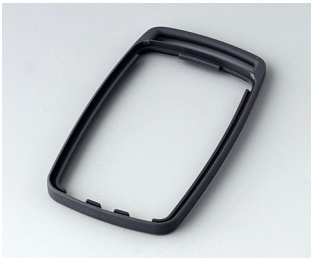
B9004702 Intermediate ring EM TPE lava