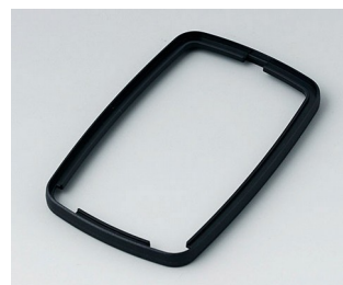
B9006786 Intermediate ring EL PMMA (IR) (UL 94 HB) black RAL 9005