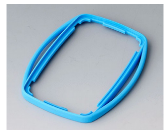
B9004755 Intermediate Ring EM TPE blue