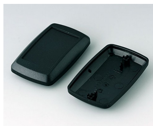
B9006816 Bottom and top part EL PMMA (IR) (UL 94 HB) black RAL 9005 3.07"x1.89"x0.94"