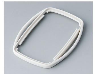
B9006757 Intermediate ring EL SEBS (TPE) off-white RAL 9002