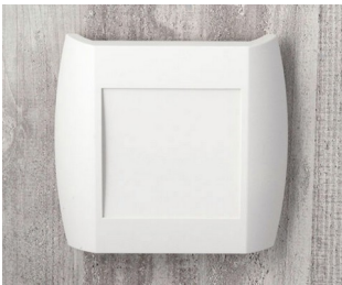
A9092107 DIATEC XS ABS (UL 94 HB) off-white RAL 9002 5.91"x1.46"x6.10" IP 40