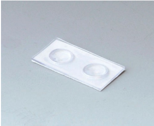
A9207150 Anti-slide feet 0.256" x 0.079" transparent