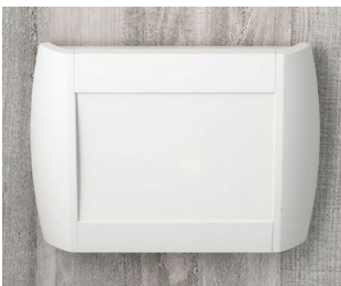
A9094107 DIATEC M ABS (UL 94 HB) off-white RAL 9002 10.63"x1.89"x7.87" IP 40