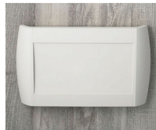
A9095107 DIATEC L ABS (UL 94 HB) off-white RAL 9002 12.99"x1.89"x7.87" IP 40