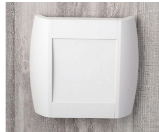
A9093107 DIATEC S ABS (UL 94 HB) off-white RAL 9002 8.27"x1.89"x7.87" IP 40