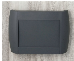
A9094108 DIATEC M ABS (UL 94 HB) lava 10.63"x1.89"x7.87" IP 40