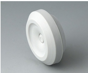
C2320147 Cable grommet TPE light gray RAL 7035 IP 67