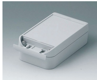
C6009161 SMART-BOX WIDTH 3.543" ASA+PC (UL 94 V-0) light gray RAL 7035 6.30"x3.54"x1.97" IP 66