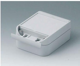
C6009121 SMART-BOX WIDTH 3.543" ASA+PC (UL 94 V-0) light gray RAL 7035 4.72"x3.54"x1.97" IP 66