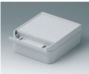
C6013161 SMART-BOX WIDTH 5.118" ASA+PC (UL 94 V-0) light gray RAL 7035 6.30"x5.12"x2.36" IP 66