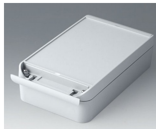
C6013221 SMART-BOX WIDTH 5.118" ASA+PC (UL 94 V-0) light gray RAL 7035 8.66"x5.12"x2.36" IP 66