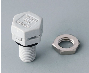
C2306917 Pressure equalization element M6x0.030" PA 6 (UL 94 HB) light gray RAL 7035 IP 56