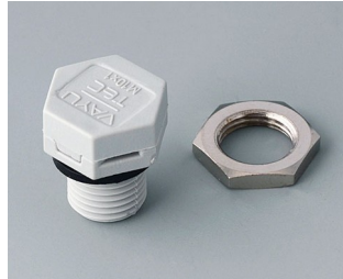
C2310917 Pressure equalization element M10x0.039" PA 6 (UL 94 HB) light gray RAL 7035 IP 56