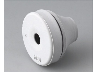
C2320137 Cable grommet EPDM light gray RAL 7035 IP 67