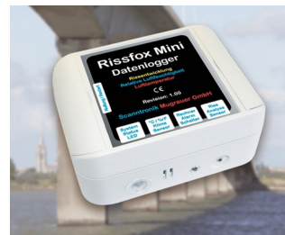
Miniature data logger for crack displacements and climatic data