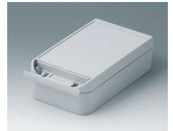
C6011201 SMART-BOX WIDTH 4.331" ASA+PC (UL 94 V-0) light gray RAL 7035 7.87"x4.33"x2.36" IP 66