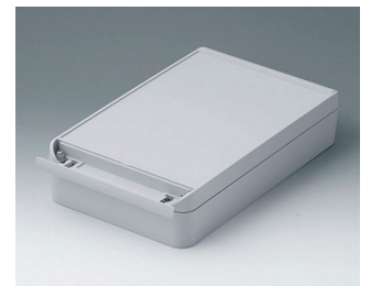
C6017281 SMART-BOX WIDTH 6.693" ASA+PC (UL 94 V-0) light gray RAL 7035 11.02"x6.69"x2.36" IP 65