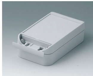
C6009161 SMART-BOX WIDTH 3.543" ASA+PC (UL 94 V-0) light gray RAL 7035 6.30"x3.54"x1.97" IP 66