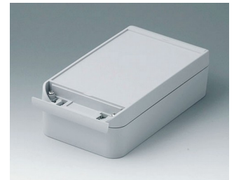
C6011201 SMART-BOX WIDTH 4.331" ASA+PC (UL 94 V-0) light gray RAL 7035 7.87"x4.33"x2.36" IP 66