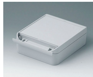
C6015181 SMART-BOX WIDTH 5.906" ASA+PC (UL 94 V-0) light gray RAL 7035 7.09"x5.91"x2.36" IP 66