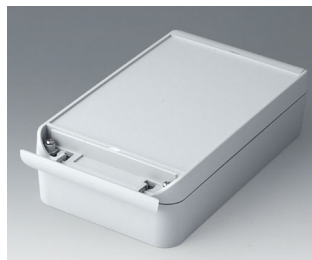
C6013221 SMART-BOX WIDTH 5.118" ASA+PC (UL 94 V-0) light gray RAL 7035 8.66"x5.12"x2.36" IP 66