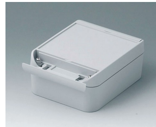
C6011141 SMART-BOX WIDTH 4.331" ASA+PC (UL 94 V-0) light gray RAL 7035 5.51"x4.33"x2.36" IP 66