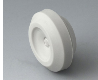
C2316147 Cable grommet TPE light gray RAL 7035 IP 67