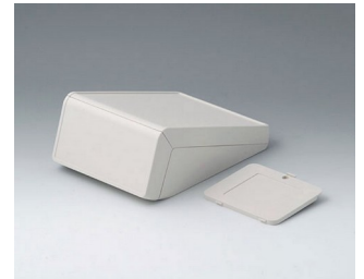
B4054337 UNITEC S, 0.02/0.06 ABS (UL 94 HB) off-white RAL 9002 4.92"x6.97"x2.72" IP 40