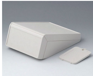
B4056217 UNITEC M, 0.06/0.06 ABS (UL 94 HB) off-white RAL 9002 5.83"x8.27"x3.15" IP 40