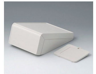
B4056337 UNITEC M, 0.02/0.06 ABS (UL 94 HB) off-white RAL 9002 5.83"x8.27"x3.15" IP 40