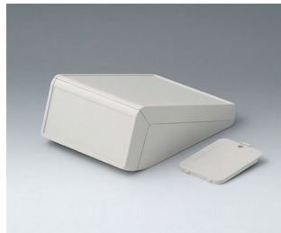
B4054217 UNITEC S, 0.06/0.06 ABS (UL 94 HB) off-white RAL 9002 4.92"x6.97"x2.72" IP 40