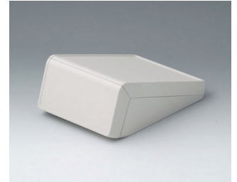
B4054137 UNITEC S, 0.02/0.06 ABS (UL 94 HB) off-white RAL 9002 4.92"x6.97"x2.72" IP 40