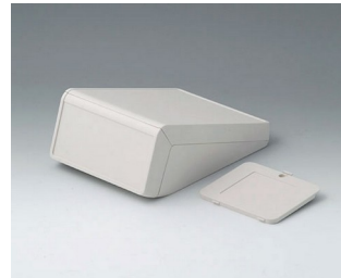
B4054327 UNITEC S, 0.06/0.02 ABS (UL 94 HB) off-white RAL 9002 4.92"x6.97"x2.72" IP 40