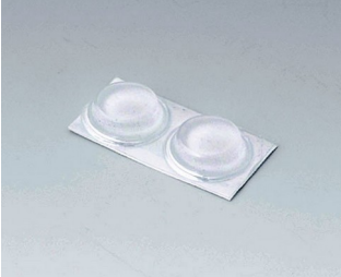
A9212330 Anti-slide feet 0.472" x 0.138" transparent

Subject to technical modification without notice. © by OKW Gehäusesysteme, Buchen/Germany.