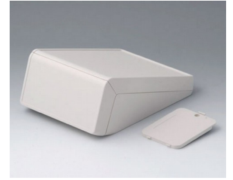
B4056237 UNITEC M, 0.02/0.06 ABS (UL 94 HB) off-white RAL 9002 5.83"x8.27"x3.15" IP 40