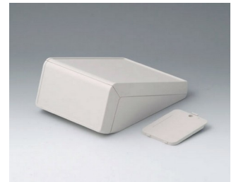
B4054237 UNITEC S, 0.02/0.06 ABS (UL 94 HB) off-white RAL 9002 4.92"x6.97"x2.72" IP 40