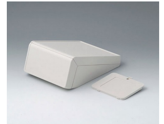
B4054337 UNITEC S, 0.02/0.06 ABS (UL 94 HB) off-white RAL 9002 4.92"x6.97"x2.72" IP 40