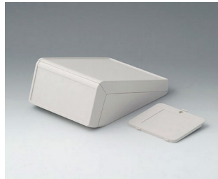
B4054317 UNITEC S, 0.06/0.06 ABS (UL 94 HB) off-white RAL 9002 4.92"x6.97"x2.72" IP 40