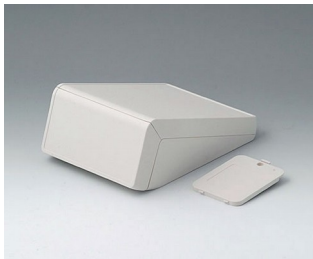
B4054207 UNITEC S, 0.02/0.02 ABS (UL 94 HB) off-white RAL 9002 4.92"x6.97"x2.72" IP 40