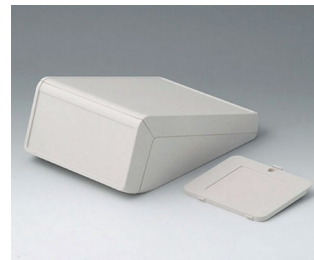
B4056327 UNITEC M, 0.06/0.02 ABS (UL 94 HB) off-white RAL 9002 5.83"x8.27"x3.15" IP 40