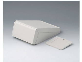
B4054337 UNITEC S, 0.02/0.06 ABS (UL 94 HB) off-white RAL 9002 4.92"x6.97"x2.72" IP 40