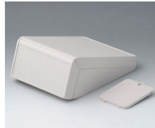
B4056227 UNITEC M, 0.06/0.02 ABS (UL 94 HB) off-white RAL 9002 5.83"x8.27"x3.15" IP 40