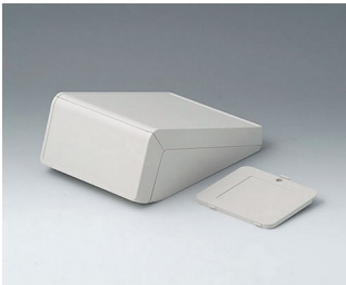
B4054307 UNITEC S, 0.02/0.02 ABS (UL 94 HB) off-white RAL 9002 4.92"x6.97"x2.72" IP 40