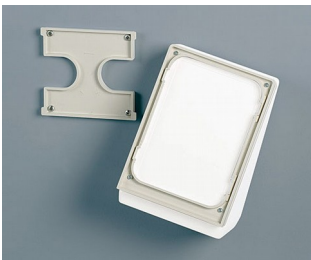
B4154307 Wall suspension element S off-white RAL 9002