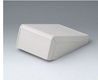
B4054127 UNITEC S, 0.06/0.02 ABS (UL 94 HB) off-white RAL 9002 4.92"x6.97"x2.72" IP 40