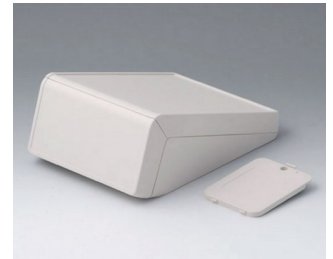
B4056237 UNITEC M, 0.02/0.06 ABS (UL 94 HB) off-white RAL 9002 5.83"x8.27"x3.15" IP 40