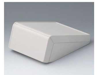
B4056137 UNITEC M, 0.02/0.06 ABS (UL 94 HB) off-white RAL 9002 5.83"x8.27"x3.15" IP 40