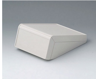
B4054117 UNITEC S, 0.06/0.06 ABS (UL 94 HB) off-white RAL 9002 4.92"x6.97"x2.72" IP 40