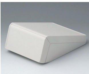
B4056107 UNITEC M, 0.02/0.02 ABS (UL 94 HB) off-white RAL 9002 5.83"x8.27"x3.15" IP 40