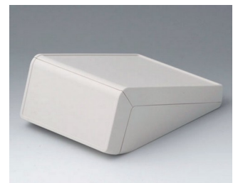
B4056137 UNITEC M, 0.02/0.06 ABS (UL 94 HB) off-white RAL 9002 5.83"x8.27"x3.15" IP 40