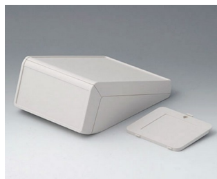
B4056317 UNITEC M, 0.06/0.06 ABS (UL 94 HB) off-white RAL 9002 5.83"x8.27"x3.15" IP 40