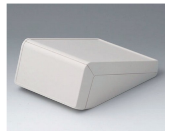
B4056137 UNITEC M, 0.02/0.06 ABS (UL 94 HB) off-white RAL 9002 5.83"x8.27"x3.15" IP 40