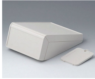
B4056217 UNITEC M, 0.06/0.06 ABS (UL 94 HB) off-white RAL 9002 5.83"x8.27"x3.15" IP 40