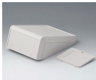
B4056317 UNITEC M, 0.06/0.06 ABS (UL 94 HB) off-white RAL 9002 5.83"x8.27"x3.15" IP 40