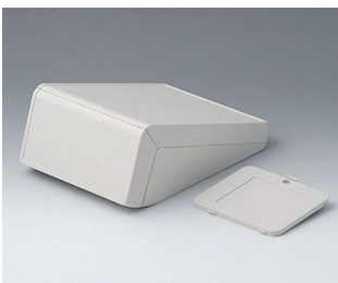
B4056307 UNITEC M, 0.02/0.02 ABS (UL 94 HB) off-white RAL 9002 5.83"x8.27"x3.15" IP 40