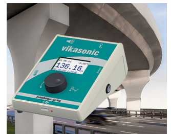
Ultrasonic measuring device