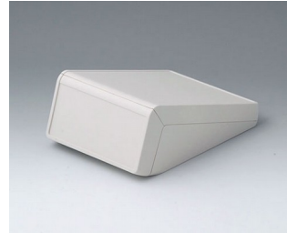
B4054127 UNITEC S, 0.06/0.02 ABS (UL 94 HB) off-white RAL 9002 4.92"x6.97"x2.72" IP 40