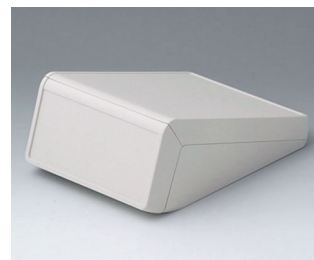
B4056127 UNITEC M, 0.06/0.02 ABS (UL 94 HB) off-white RAL 9002 5.83"x8.27"x3.15" IP 40