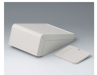
B4056337 UNITEC M, 0.02/0.06 ABS (UL 94 HB) off-white RAL 9002 5.83"x8.27"x3.15" IP 40