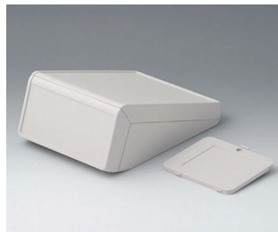
B4056317 UNITEC M, 0.06/0.06 ABS (UL 94 HB) off-white RAL 9002 5.83"x8.27"x3.15" IP 40