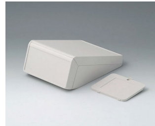
B4054327 UNITEC S, 0.06/0.02 ABS (UL 94 HB) off-white RAL 9002 4.92"x6.97"x2.72" IP 40