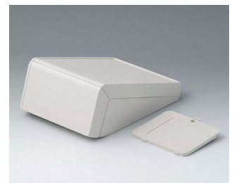
B4056337 UNITEC M, 0.02/0.06 ABS (UL 94 HB) off-white RAL 9002 5.83"x8.27"x3.15" IP 40