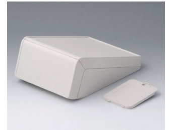
B4056237 UNITEC M, 0.02/0.06 ABS (UL 94 HB) off-white RAL 9002 5.83"x8.27"x3.15" IP 40