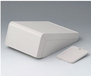
B4056207 UNITEC M, 0.02/0.02 ABS (UL 94 HB) off-white RAL 9002 5.83"x8.27"x3.15" IP 40