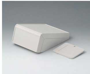
B4054317 UNITEC S, 0.06/0.06 ABS (UL 94 HB) off-white RAL 9002 4.92"x6.97"x2.72" IP 40