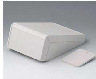
B4056227 UNITEC M, 0.06/0.02 ABS (UL 94 HB) off-white RAL 9002 5.83"x8.27"x3.15" IP 40