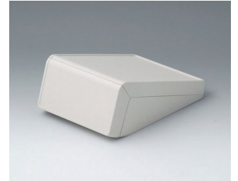
B4054137 UNITEC S, 0.02/0.06 ABS (UL 94 HB) off-white RAL 9002 4.92"x6.97"x2.72" IP 40