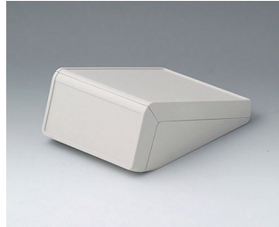
B4054117 UNITEC S, 0.06/0.06 ABS (UL 94 HB) off-white RAL 9002 4.92"x6.97"x2.72" IP 40