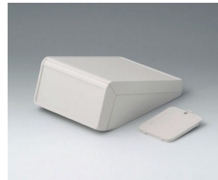
B4054227 UNITEC S, 0.06/0.02 ABS (UL 94 HB) off-white RAL 9002 4.92"x6.97"x2.72" IP 40