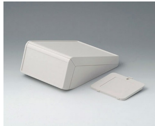
B4054317 UNITEC S, 0.06/0.06 ABS (UL 94 HB) off-white RAL 9002 4.92"x6.97"x2.72" IP 40