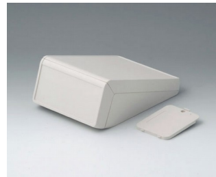
B4054227 UNITEC S, 0.06/0.02 ABS (UL 94 HB) off-white RAL 9002 4.92"x6.97"x2.72" IP 40