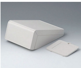
B4056307 UNITEC M, 0.02/0.02 ABS (UL 94 HB) off-white RAL 9002 5.83"x8.27"x3.15" IP 40