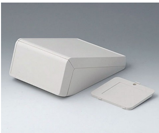
B4056307 UNITEC M, 0.02/0.02 ABS (UL 94 HB) off-white RAL 9002 5.83"x8.27"x3.15" IP 40