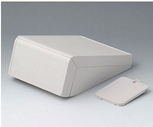
B4056207 UNITEC M, 0.02/0.02 ABS (UL 94 HB) off-white RAL 9002 5.83"x8.27"x3.15" IP 40