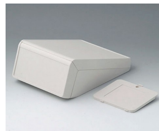
B4056327 UNITEC M, 0.06/0.02 ABS (UL 94 HB) off-white RAL 9002 5.83"x8.27"x3.15" IP 40