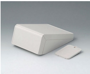
B4054207 UNITEC S, 0.02/0.02 ABS (UL 94 HB) off-white RAL 9002 4.92"x6.97"x2.72" IP 40