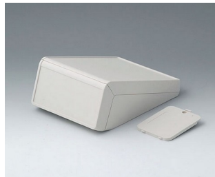
B4054217 UNITEC S, 0.06/0.06 ABS (UL 94 HB) off-white RAL 9002 4.92"x6.97"x2.72" IP 40