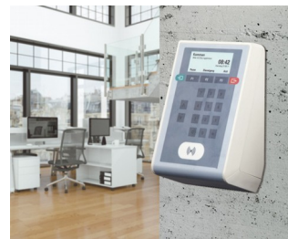
Time recording terminal