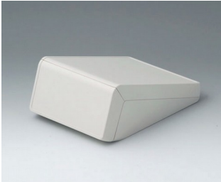
B4054107 UNITEC S, 0.02/0.02 ABS (UL 94 HB) off-white RAL 9002 4.92"x6.97"x2.72" IP 40