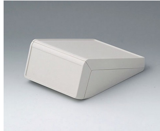
B4054117 UNITEC S, 0.06/0.06 ABS (UL 94 HB) off-white RAL 9002 4.92"x6.97"x2.72" IP 40