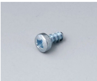
A0306031 Self-tapping screws 0.118" x 0.236" (PZ1)