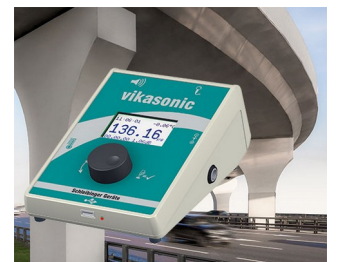
Ultrasonic measuring device