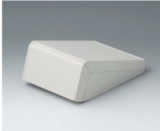
B4054107 UNITEC S, 0.02/0.02 ABS (UL 94 HB) off-white RAL 9002 4.92"x6.97"x2.72" IP 40