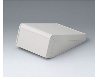
B4054127 UNITEC S, 0.06/0.02 ABS (UL 94 HB) off-white RAL 9002 4.92"x6.97"x2.72" IP 40