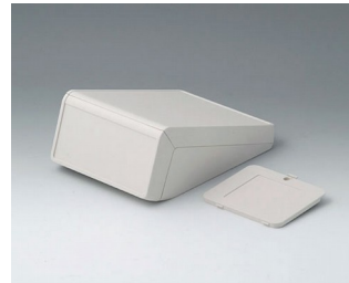
B4054327 UNITEC S, 0.06/0.02 ABS (UL 94 HB) off-white RAL 9002 4.92"x6.97"x2.72" IP 40