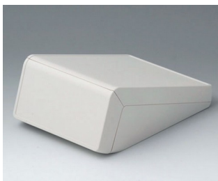
B4056107 UNITEC M, 0.02/0.02 ABS (UL 94 HB) off-white RAL 9002 5.83"x8.27"x3.15" IP 40