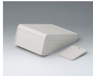
B4054227 UNITEC S, 0.06/0.02 ABS (UL 94 HB) off-white RAL 9002 4.92"x6.97"x2.72" IP 40