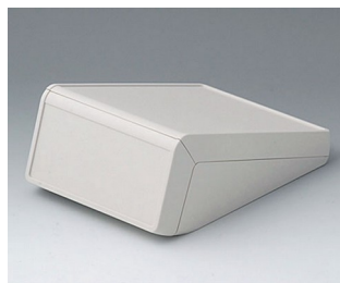
B4056117 UNITEC M, 0.06/0.06 ABS (UL 94 HB) off-white RAL 9002 5.83"x8.27"x3.15" IP 40