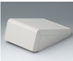
B4056107 UNITEC M, 0.02/0.02 ABS (UL 94 HB) off-white RAL 9002 5.83"x8.27"x3.15" IP 40