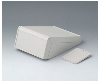
B4054217 UNITEC S, 0.06/0.06 ABS (UL 94 HB) off-white RAL 9002 4.92"x6.97"x2.72" IP 40