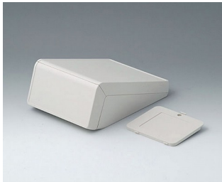
B4054307 UNITEC S, 0.02/0.02 ABS (UL 94 HB) off-white RAL 9002 4.92"x6.97"x2.72" IP 40