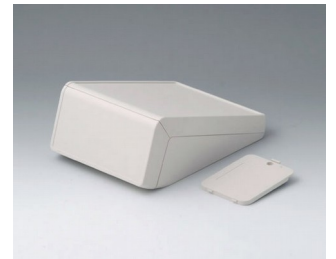
B4054237 UNITEC S, 0.02/0.06 ABS (UL 94 HB) off-white RAL 9002 4.92"x6.97"x2.72" IP 40