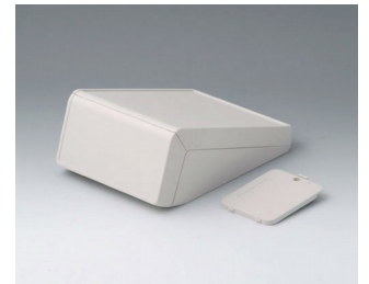
B4054237 UNITEC S, 0.02/0.06 ABS (UL 94 HB) off-white RAL 9002 4.92"x6.97"x2.72" IP 40