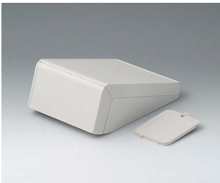
B4054207 UNITEC S, 0.02/0.02 ABS (UL 94 HB) off-white RAL 9002 4.92"x6.97"x2.72" IP 40