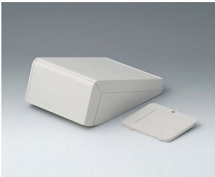
B4054307 UNITEC S, 0.02/0.02 ABS (UL 94 HB) off-white RAL 9002 4.92"x6.97"x2.72" IP 40