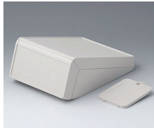
B4056217 UNITEC M, 0.06/0.06 ABS (UL 94 HB) off-white RAL 9002 5.83"x8.27"x3.15" IP 40