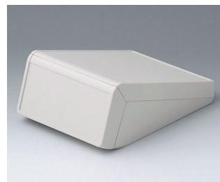
B4056127 UNITEC M, 0.06/0.02 ABS (UL 94 HB) off-white RAL 9002 5.83"x8.27"x3.15" IP 40