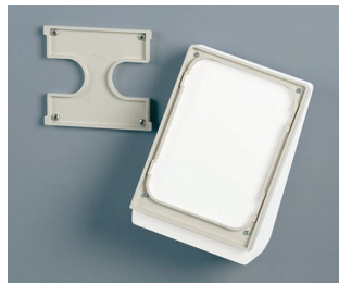
B4156307 Wall suspension element M off-white RAL 9002