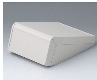
B4056127 UNITEC M, 0.06/0.02 ABS (UL 94 HB) off-white RAL 9002 5.83"x8.27"x3.15" IP 40