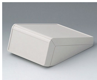
B4056117 UNITEC M, 0.06/0.06 ABS (UL 94 HB) off-white RAL 9002 5.83"x8.27"x3.15" IP 40