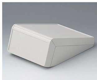
B4056117 UNITEC M, 0.06/0.06 ABS (UL 94 HB) off-white RAL 9002 5.83"x8.27"x3.15" IP 40