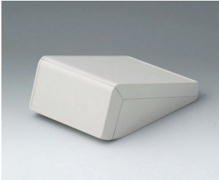
B4054107 UNITEC S, 0.02/0.02 ABS (UL 94 HB) off-white RAL 9002 4.92"x6.97"x2.72" IP 40