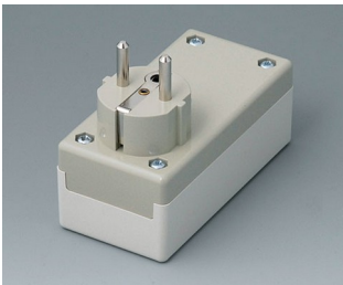
A9011665 PLUG CASE F / D, Vers. I PC+ABS (UL 94 V-0) off-white RAL 9002 3.94"x1.97"x1.57"