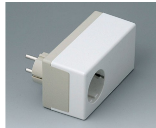
A9022465 PLUG CASE D, Vers. II PC+ABS (UL 94 V-0) pebble gray RAL 7032 4.72"x2.56"x2.17"