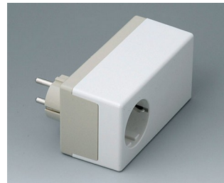
A9022465 PLUG CASE D, Vers. II PC+ABS (UL 94 V-0) pebble gray RAL 7032 4.72"x2.56"x2.17"