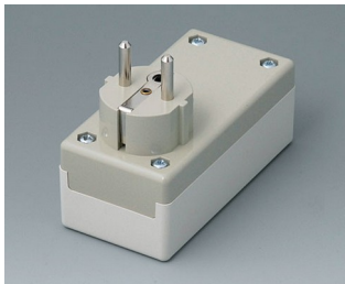
A9011665 PLUG CASE F / D, Vers. I PC+ABS (UL 94 V-0) off-white RAL 9002 3.94"x1.97"x1.57"