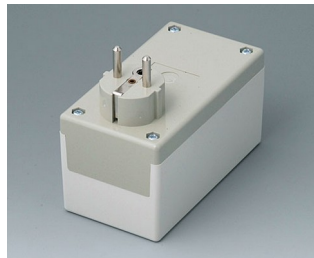
A9021665 PLUG CASE F / D, Vers. I PC+ABS (UL 94 V-0) pebble gray RAL 7032 4.72"x2.56"x2.56"