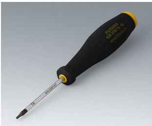
A0399T06 Torx T6 screwdriver