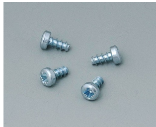
B5111201 Set of screws

Subject to technical modification without notice. © by OKW Gehäusesysteme, Buchen/Germany.