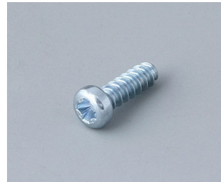
A0325080 Self-tapping screws 0.098" x 0.315" (PZ1)