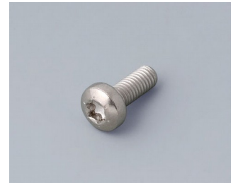
A0330080 Screw M3 x 3.150" (T10) Stainless steel