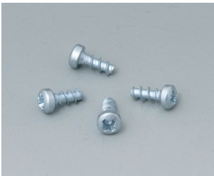
A9199008 Set of screws