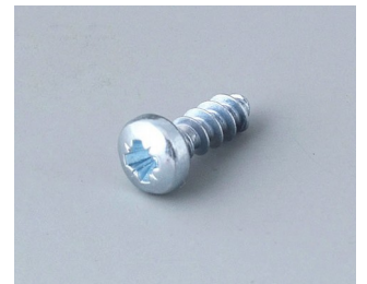
A0308031 Self-tapping screws 0.118" x 0.315" (PZ1)