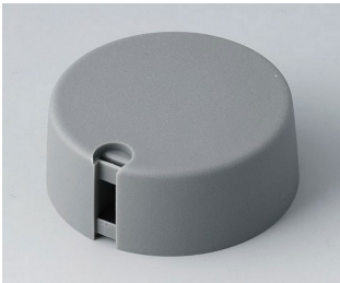
A1040648 TOP-KNOBS 40 PA 6 volcano 40x16mm