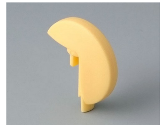
A1103004 Disk PA 6 (UL 94 HB) beach