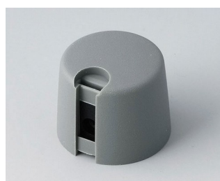
A1020638 TOP-KNOBS 20 PA 6 volcano 20x16mm 1/4"