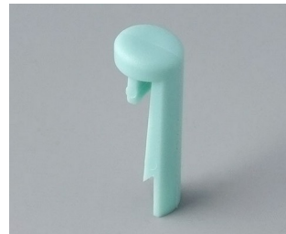
A1101005 Pin PA 6 (UL 94 HB) lagoon