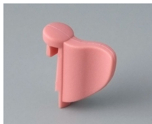
A1104003 Wing PA 6 (UL 94 HB) coral