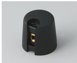
A1016049 TOP-KNOBS 16 PA 6 nero 16x16mm 4mm