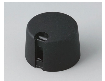
A1024049 TOP-KNOBS 24 PA 6 nero 24x16mm 4mm