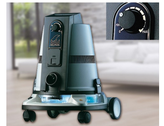
Operating element for a vacuum cleaner