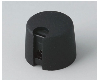
A1020649 TOP-KNOBS 20 PA 6 nero 20x16mm