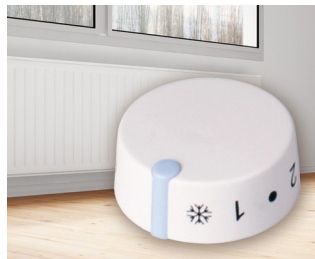
Integrated thermostat for electric storage heaters