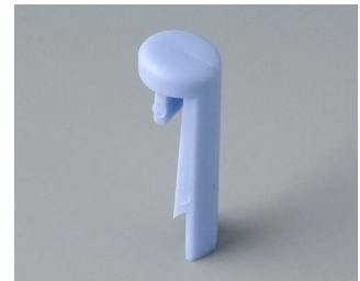
A1101006 Pin PA 6 (UL 94 HB) sky