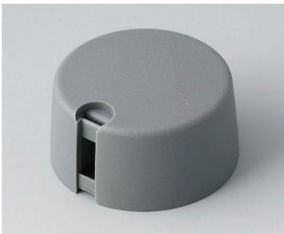
A1031648 TOP-KNOBS 31 PA 6 volcano 31x16mm