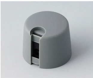
A1020648 TOP-KNOBS 20 PA 6 volcano 20x16mm