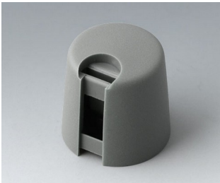
A1016648 TOP-KNOBS 16 PA 6 volcano 16x16mm