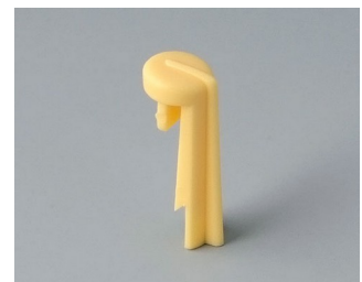
A1105004 Arrow PA 6 (UL 94 HB) beach