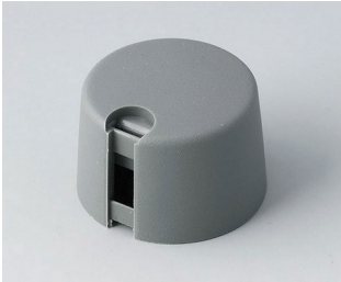
A1024648 TOP-KNOBS 24 PA 6 volcano 24x16mm