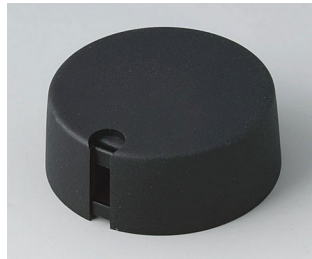
A1040649 TOP-KNOBS 40 PA 6 nero 40x16mm