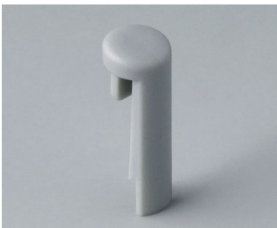
A1101007 Pin PA 6 (UL 94 HB) mineral