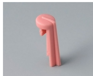
A1105003 Arrow PA 6 (UL 94 HB) coral