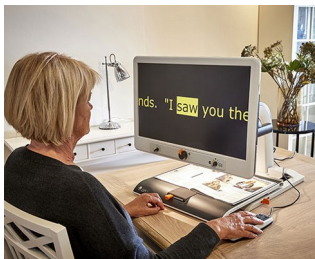
Control knobs for video magnifier