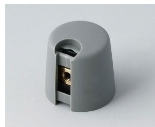
A1016068 TOP-KNOBS 16 PA 6 volcano 16x16mm 6mm