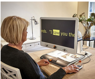
Control knobs for video magnifier