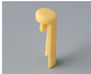
A1101004 Pin PA 6 (UL 94 HB) beach