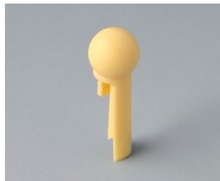
A1102004 Globe PA 6 (UL 94 HB) beach