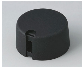
A1031649 TOP-KNOBS 31 PA 6 nero 31x16mm