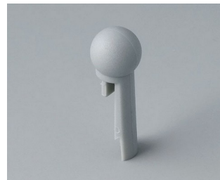
A1102007 Globe PA 6 (UL 94 HB) mineral