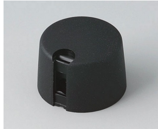
A1024649 TOP-KNOBS 24 PA 6 nero 24x16mm