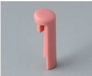
A1101003 Pin PA 6 (UL 94 HB) coral