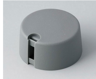
A1031048 TOP-KNOBS 31 PA 6 volcano 31x16mm 4mm