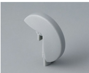
A1103007 Disk PA 6 (UL 94 HB) mineral