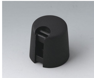
A1016649 TOP-KNOBS 16 PA 6 nero 16x16mm