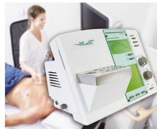
Operating element for a diagnostic device