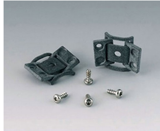
C8100360 Internal hinge set