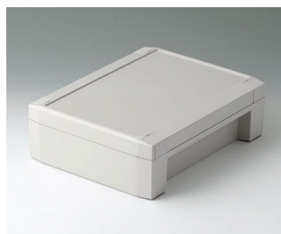
C8017222 SOLID-BOX 175 PC+ABS (UL 94 V-0) light gray RAL 7035 8.86"x6.89"x2.76" IP 66, IP 67, IK 08