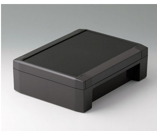
C8017221 SOLID-BOX 175 PC+ABS (UL 94 V-0) anthracite gray RAL 7016 8.86"x6.89"x2.76" IP 66, IP 67, IK 08