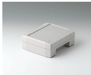
C8011132 SOLID-BOX 115 PC+ABS (UL 94 V-0) light gray RAL 7035 5.31"x4.53"x1.97" IP 66, IP 67, IK 08