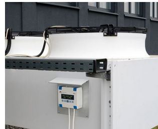
Heating/air conditioning/ventilation control