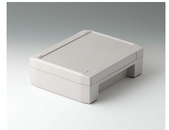
C8014182 SOLID-BOX 145 PC+ABS (UL 94 V-0) light gray RAL 7035 7.09"x5.71"x2.36" IP 66, IP 67, IK 08