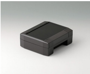
C8011131 SOLID-BOX 115 PC+ABS (UL 94 V-0) anthracite gray RAL 7016 5.31"x4.53"x1.97" IP 66, IP 67, IK 08