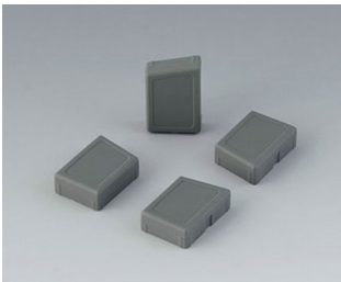
C8100188 Set of enclosure feet SEBS (TPE) volcano

Subject to technical modification without notice. © by OKW Gehäusesysteme, Buchen/Germany.