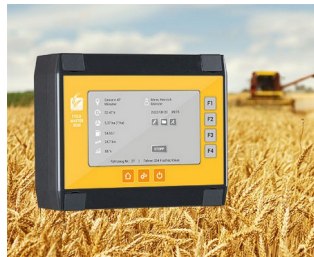
Data recording for harvesters