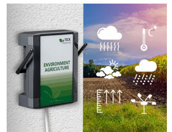
Weather station in agriculture