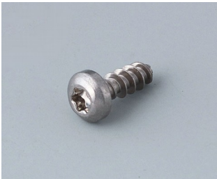
A0308132 Self-tapping screw 0.118" x 0.315" (T10) Stainless steel