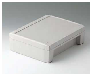
C8017222 SOLID-BOX 175 PC+ABS (UL 94 V-0) light gray RAL 7035 8.86"x6.89"x2.76" IP 66, IP 67, IK 08