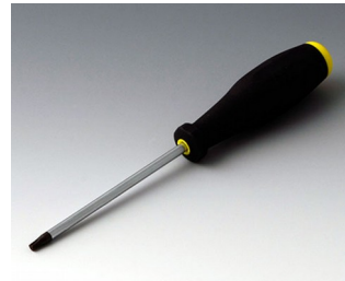
A0399T20 Torx T20 screwdriver