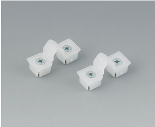
C2299031 Securing hinge for the cover PP natural-colored