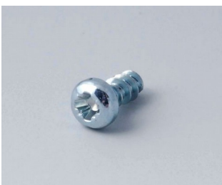
A0305031 Self-tapping screws 0.098" x 0.236" (PZ1)