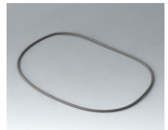
A9504030 Sealing 150