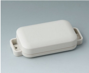
C3204107 EASYTEC 80 ASA+PC (UL 94 V-0) off-white RAL 9002 3.98"x1.97"x0.87" IP 65 opt., IP 40