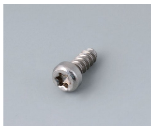
A0325060 Self-tapping screw 0.098" x 0.236" (T8) Stainless steel