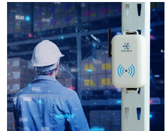
Smart store logistics