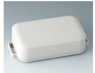
C3208207 EASYTEC 150 ASA+PC (UL 94 V-0) off-white RAL 9002 6.77"x3.66"x1.81" IP 65 opt., IP 40