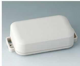
C3207207 EASYTEC 125 ASA+PC (UL 94 V-0) off-white RAL 9002 5.79"x3.07"x1.46" IP 65 opt., IP 40