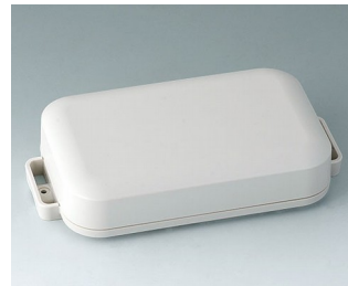
C3208107 EASYTEC 150 ASA+PC (UL 94 V-0) off-white RAL 9002 6.77"x3.66"x1.42" IP 65 opt., IP 40