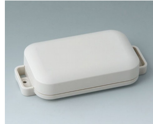
C3206107 EASYTEC 100 ASA+PC (UL 94 V-0) off-white RAL 9002 4.76"x2.44"x1.02" IP 65 opt., IP 40