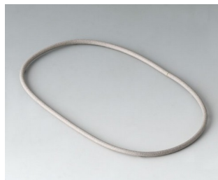
A9502030 Sealing 100