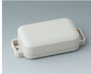
C3204207 EASYTEC 80 ASA+PC (UL 94 V-0) off-white RAL 9002 3.98"x1.97"x1.02" IP 65 opt., IP 40