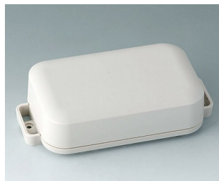
C3207207 EASYTEC 125 ASA+PC (UL 94 V-0) off-white RAL 9002 5.79"x3.07"x1.46" IP 65 opt., IP 40