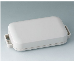
C3207107 EASYTEC 125 ASA+PC (UL 94 V-0) off-white RAL 9002 5.79"x3.07"x1.18" IP 65 opt., IP 40