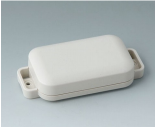
C3204107 EASYTEC 80 ASA+PC (UL 94 V-0) off-white RAL 9002 3.98"x1.97"x0.87" IP 65 opt., IP 40