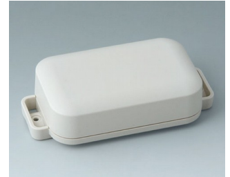
C3206207 EASYTEC 100 ASA+PC (UL 94 V-0) off-white RAL 9002 4.76"x2.44"x1.22" IP 65 opt., IP 40