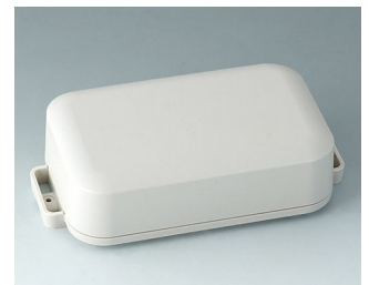
C3208207 EASYTEC 150 ASA+PC (UL 94 V-0) off-white RAL 9002 6.77"x3.66"x1.81" IP 65 opt., IP 40