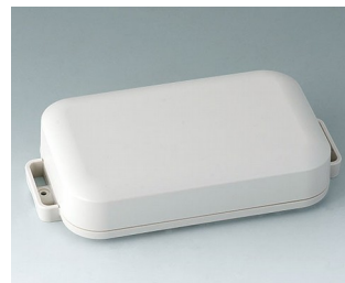
C3208107 EASYTEC 150 ASA+PC (UL 94 V-0) off-white RAL 9002 6.77"x3.66"x1.42" IP 65 opt., IP 40