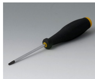
A0399T08 Torx T8 screwdriver