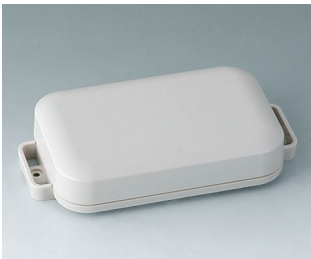
C3207107 EASYTEC 125 ASA+PC (UL 94 V-0) off-white RAL 9002 5.79"x3.07"x1.18" IP 65 opt., IP 40