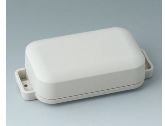
C3206207 EASYTEC 100 ASA+PC (UL 94 V-0) off-white RAL 9002 4.76"x2.44"x1.22" IP 65 opt., IP 40