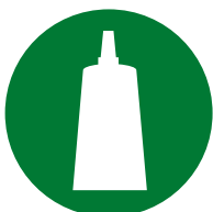
Installation / Assembly of accessories