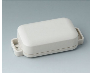
C3204207 EASYTEC 80 ASA+PC (UL 94 V-0) off-white RAL 9002 3.98"x1.97"x1.02" IP 65 opt., IP 40