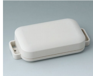
C3206107 EASYTEC 100 ASA+PC (UL 94 V-0) off-white RAL 9002 4.76"x2.44"x1.02" IP 65 opt., IP 40