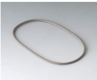
A9500030 Sealing 80